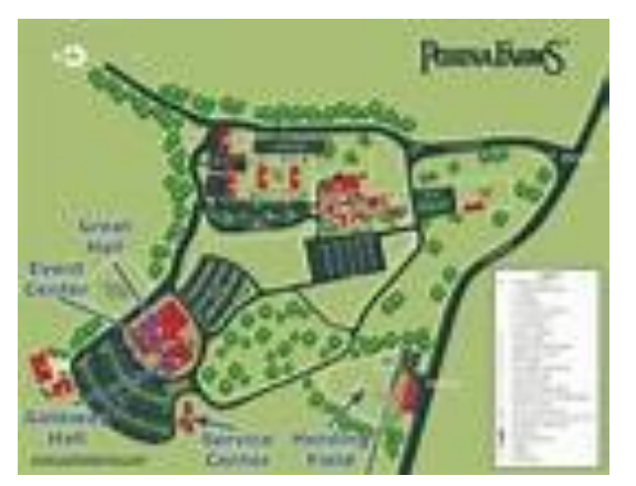
Purina Farms will donate Best of Breed Purina Pro Plan Backpack

Routes to Field: Purina Farms is located just 10 minutes west of Six Flags St. Louis off HWY I-44. Take the Gray Summit exit #253 and head north on HWY 100. Turn left on HWY MM and proceed a mile to Purina Farms main entrance on the left. Look for large security gate.